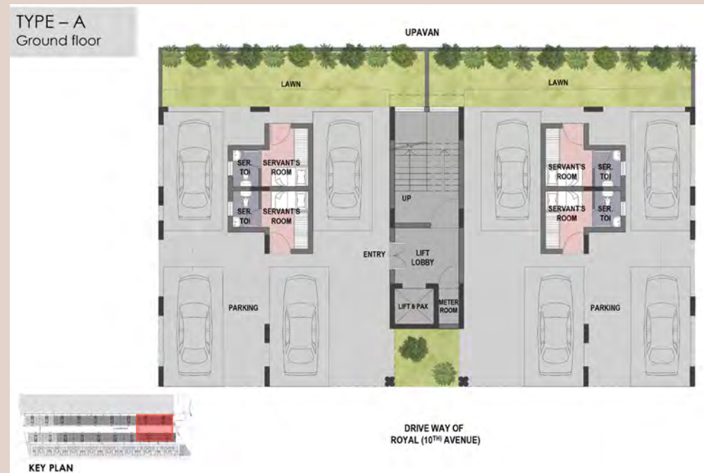
TYPE - A - Ground Floor Plan