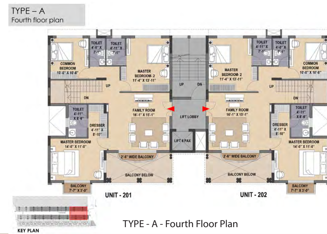
TYPE - A - Fourth Floor Plan