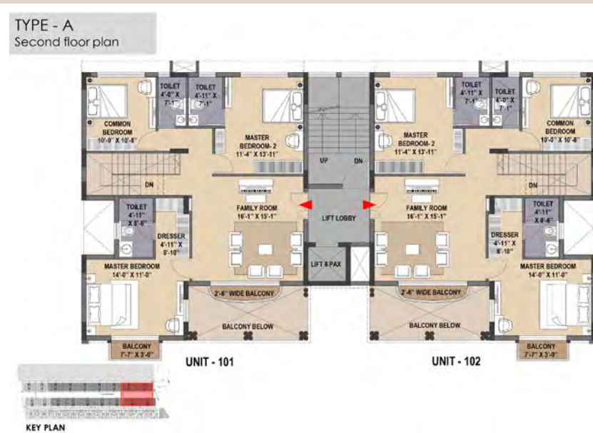
TYPE - A - Second Floor Plan