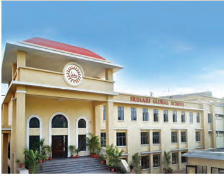
Srihari Global School